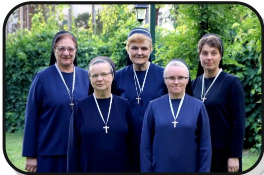
SSMI General Curia 2017-2023